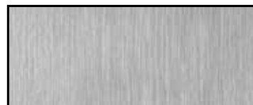
358 TREND BE Chromosat