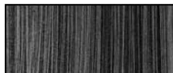
375 TREND Antique silver