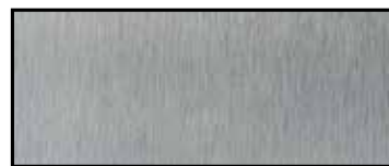
350 TREND Chromosat