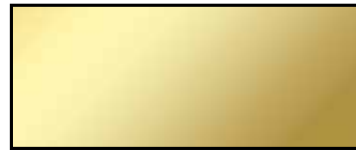
310 TREND Gold