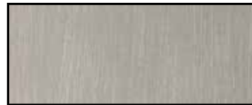
348 TREND BE Nickelsat